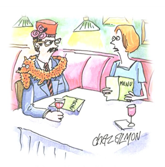
"It's been my biggest fear, Arthur, that you would turn into your mother.

"So continuing daily with one accord in the temple, and breaking bread from house to house, they ate their food with gladness and simplicity of heart, praising GOD and having favor with all the people...."