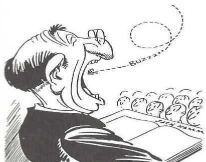
"HE WAS A STRANGER AND I TOOK HIM IN."