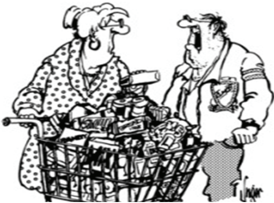
"I'll run out and mortgage the house and meet you at the checkout."